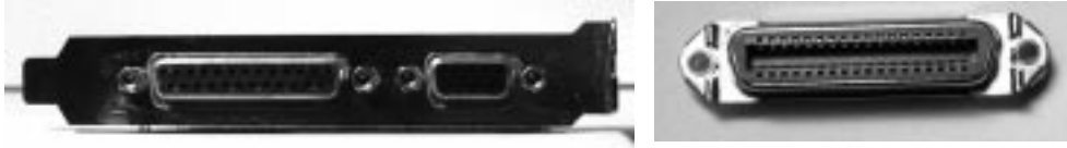
Figure 1-2: The photo on the left shows the back panel of an expansion card, with a parallel port's 25-pin female D-sub connector on the left side of the panel. (The other connector is for a video monitor.) The photo on the right shows the 36-pin female Centronics connector used on most printers.

fer information between the parallel port and the CPU, memory, and other system components.